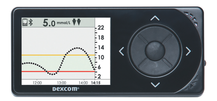
Figure 2: Continuous Glucose Monitoring Displays Current Glucose, Glucose Direction , Alert Thresholds and Velocity of Change

In a recent crossover study by Battelino and colleagues looking at CGM benefit among T1D individuals using CSII, investigators reported lower HbA, when CGM was used.<sup>43</sup> CGM use was associated with significant increases in the mean number of daily boluses (6.8 \pm 2.5 versus 5.8 \pm 1.9, p<0.0001), frequency of temporary basal rates (0.75 \pm 1.11 versus 0.26 \pm 0.47, p<0.0001) and frequency of manual insulin suspension (0.91 \pm 1.25 versus 0.70 \pm 0.75, p<0.018). Investigators concluded that frequent insulin self-adjustments may have contributed to HbA<sub>10</sub> improvement.